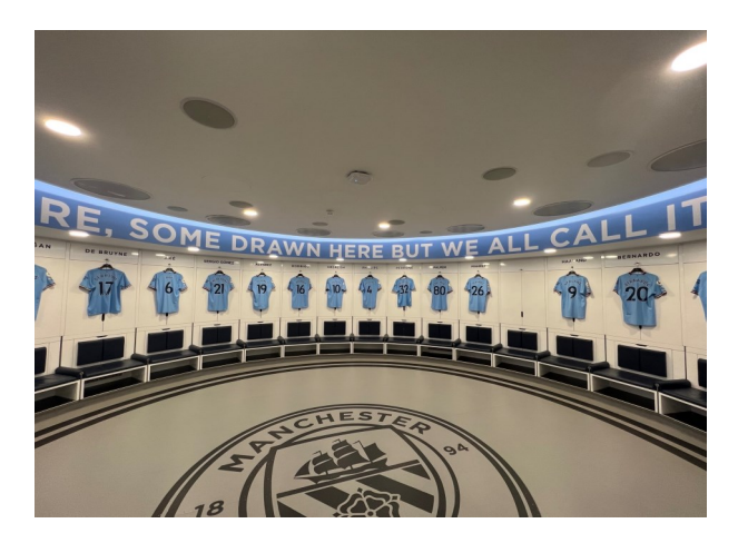
Above: Manchester City Change Rooms at Etihad Stadium. Below: EPL Premiers, Etihad Stadium