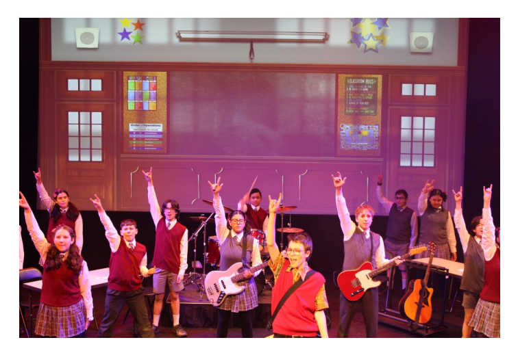
Above: Students rehearsing for the upcoming musical, The School of Rock.