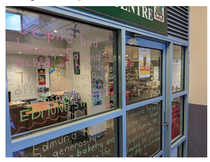
Above: Windows at the CCLC that showed different aspects of Edmund's life.

The Caroline Chisholm Learning Centre (CCLC) glass art wall was a feature for Edmund Rice Feast Day, with windows featuring a different aspect of Edmund's life.