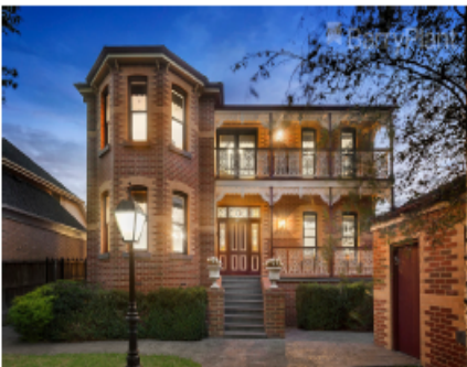
65 Snake Gully Dve, Bundoora sold in December for $1,666,000

To discuss any of your real estate needs and to tap into decades of experience within the industry contact us for straight forward and professional advice.