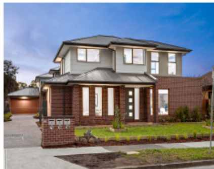
This architecturally designed property in Watsonia sold for a townhouse record price of $1,005,000.