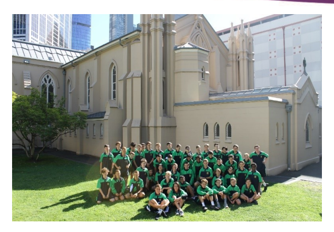
Above: Year 7 Treacy House visit St Francis Church

To understand some of the hardships, which the Brothers endured, we travelled to a handful of sites on the bus. From Station Pier where they first docked after ten uncomfortable weeks at sea, to the original site of Parade College in East Melbourne and from the Saint Francis Church where the first pioneering Brothers school was formed (in Australia), to