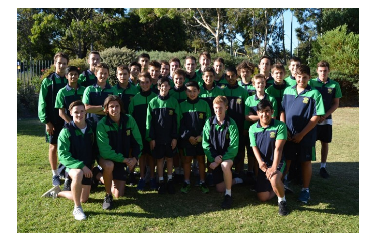
2019 Parade Swim Team

Congratulations to all swimmers on not only their efforts in the pool, but also in the manner in which they conducted themselves throughout the night.