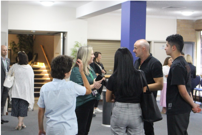
Above: VCE families meeting with our Student Wellbeing Team