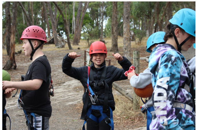
Above: Last year's Year 7 students enjoying their Year 7 Camp

The return date for consent, dietary, and medical requirements was Monday 19 February. Please ensure you have completed this for your son. All Year 7 students will be going with their House Leaders so if families have any questions, please contact your son's House Leader, Tutor Teacher, or myself.