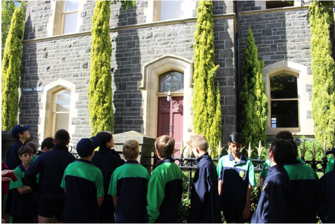
Above: Last year's Year 7 students learning about Parade's History on their Treacy Trail

We are currently confirming campsites and dates within the week of 4 March for Nolan and Lynch House as the original site has overdue building work in progress. Communication with all Year 7 families will occur this week.