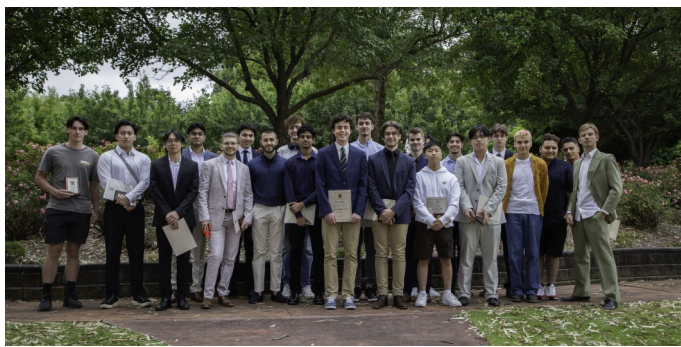
Above: Our 2023 High Achievers

During our last College Assembly, we had the pleasure of recognising the achievements of the VCE and VCE Vocational Major Class of 2023. Celebrating the accomplishments of our students is a crucial part of inspiring them to persistently pursue excellence. Our College is committed to cultivating an environment that encourages success and development within our school community.