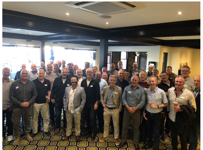
Above: The Class of 1984 at their reunion

Over 100 past students have now attended our last two reunions. The level of appreciation to the College and the Old Paradians' Association for organising these events is substantial and the Association enjoys organising these events.