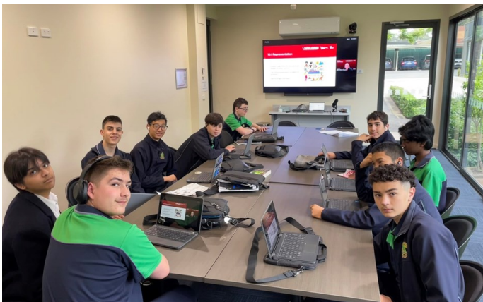
Above: Year 9 Student Leaders joining in on the Global Youth Forum