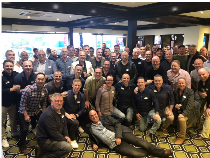
Above: The Class of 1994 at their reunion