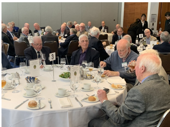
Above: Guests at the monthly Old Paradians' Luncheons

Today, I had the privilege of attending the monthly Old Paradians luncheon at the RACV Club in Melbourne. This luncheon has been a regular fixture on the Old Paradians calendar for many years. It has been strongly supported by many Old Paradians over the years and the feeling of gratitude and mateship within the room is obvious.