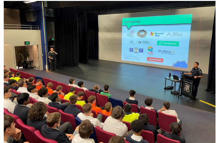
Above: Year 10 students listening to the most recent Protective Policing Unit Presentation

Our Year 10 students recently attended an insightful presentation by the Proactive Policing Unit (PPU), led by local police officers. The session provided valuable guidance on cyber security and responsible social media use, emphasising the importance of safe online habits.