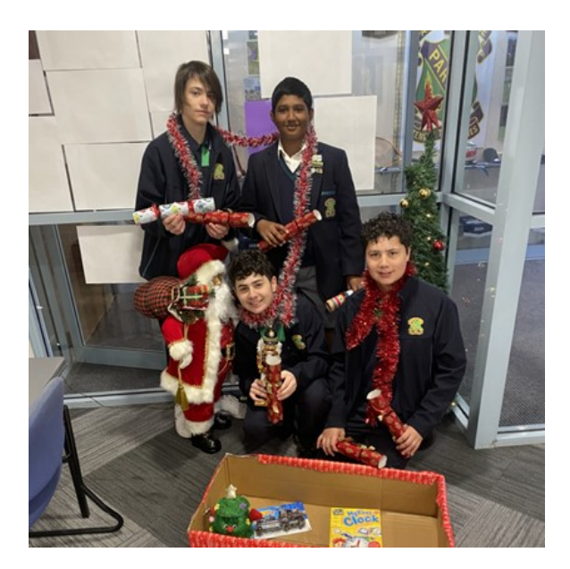
Above: Students getting ready for the Christmas Toy Drive

We hope to fill our hamper and present to St Vincent de Paul's at the Preston Campus on Monday 13 November.