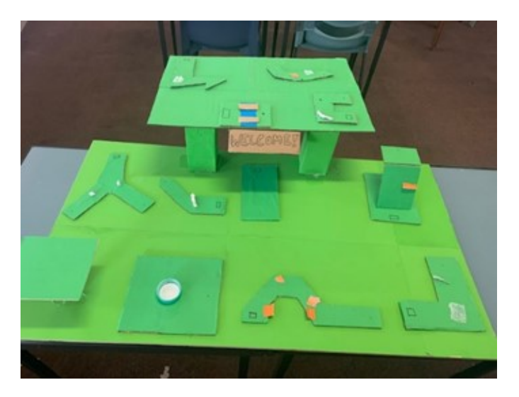
Above: Year 10 students Mini Golf assessment

Our Year 10 Numeracy students completed some great work with their Mini Golf Model models. The students created a 9hole mini golf course for the Edmund Rice Pathway Program Numeracy Assessment.