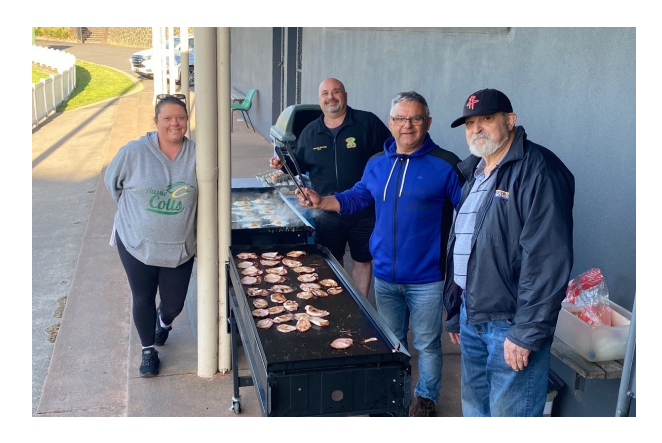
Above: POP cooking the BBQ for the Parent and Carers Breakfast

POP had the pleasure of putting on breakfast for Parade Parents and Carers to thank them for the great work they do for the students. We had a wonderful turnout on a beautiful morning enjoying a delicious breakfast with great views from the Frank Mount Rooms, Garvey Oval.