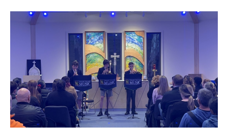
Above: Students performing in the Chapel for the Instrumental Music Soiree

Congratulations to all of the performers and to the staff that dedicated their time to working with the students and preparing them for the event.