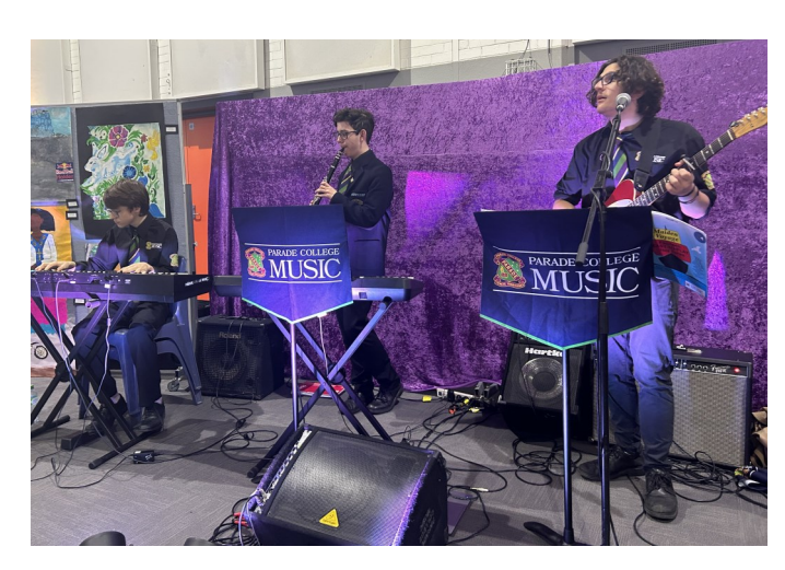
Above: Students performing at the Art and Technology Exhibition

Congratulations to the Art and Technology department on a fabulous Exhibition and thank you for inviting us to be a part of it.