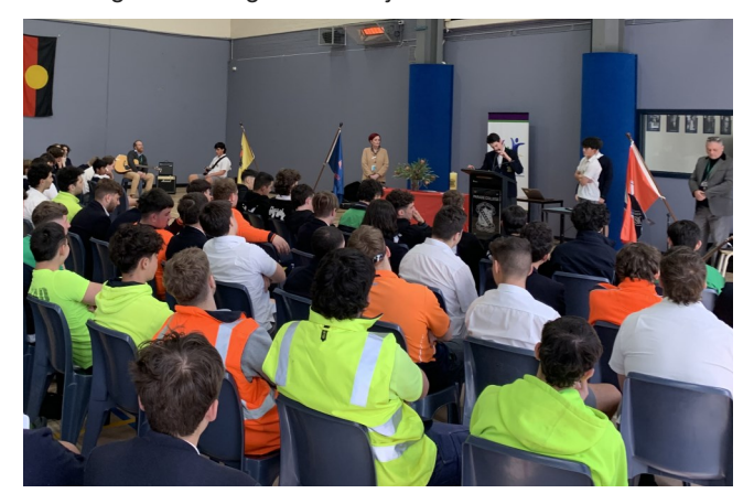
Above: Preston Campus gathering together for the Year 12 Liturgy

All students and staff from the Preston Campus attended in an atmosphere of respect, gratitude, and collegiality. There was an obvious spiritual feel that was further enhanced by the liturgical readings from our junior cohort of students.