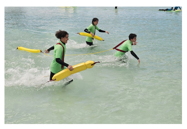
Above: Year 9 Students enjoying the day at URBNSURF Tullamarine as part of Development Week

In the final week of Term 3, our Year 9 students participated in a range of excursions and activities designed to take them out of their comfort zone, while building resilience and camaraderie amongst the cohort as they prepare for the senior years of their education. The activities included kayaking, surf lessons at URBNSURF Tullamarine, Indigenous games and activities, and the very important ManCave program.