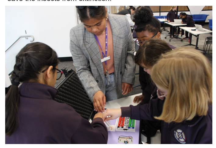
Above: St Joseph Mernda students working on their STEM activity in the NLC

In the immersion, students learned about the importance of insects in the ecosystem and then completed challenges to save the insects from extinction.