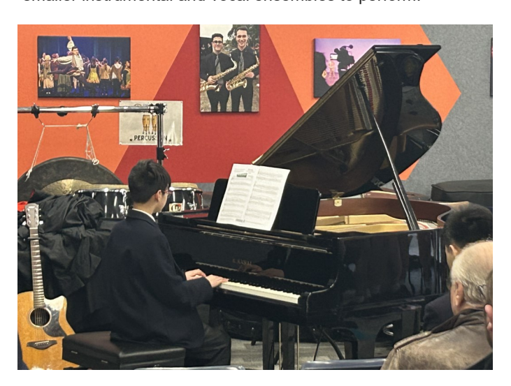
Above: Students performing at the Instrumental Music Soiree

Students prepared a short piece or duet to perform and delighted audiences with a solo performance. This was also an opportunity for some of our VCE Music Performance Students to perform their more challenging selections from their upcoming solo performance exams and for some of our smaller instrumental and vocal ensembles to perform.