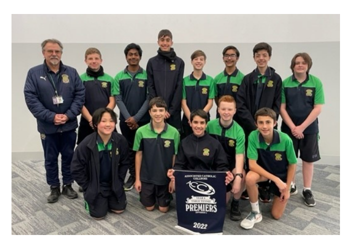
Premiers: Year 8 Table Tennis above, and Year 9 Basketball below