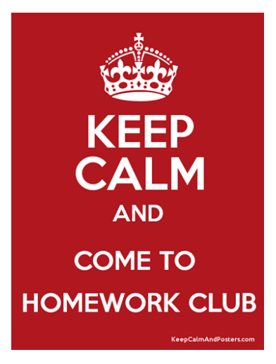
Tuesdays and Wednesdays at the Resource Centres 3.15pm to 4.30pm