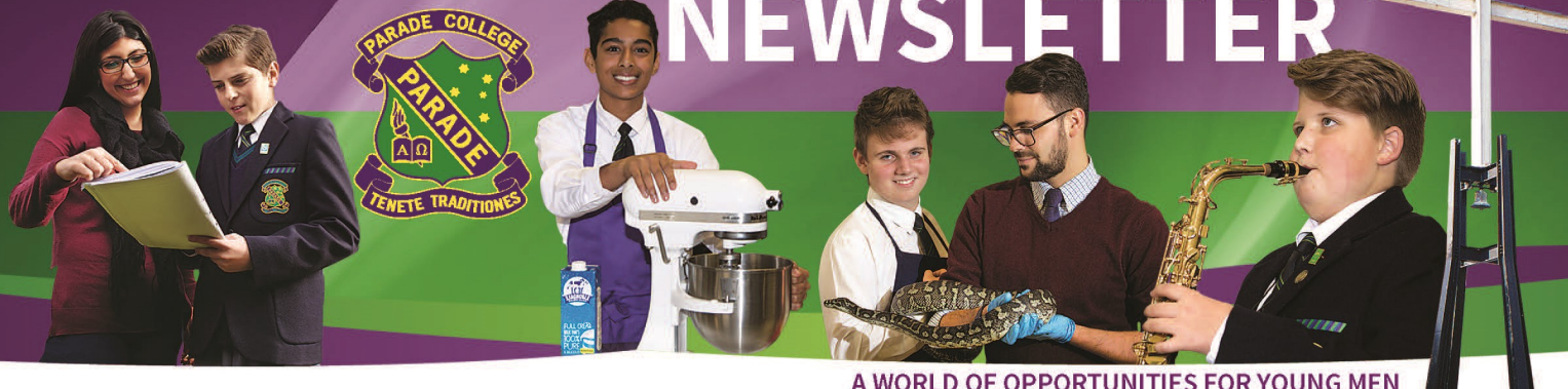
A WORLD OF OPPORTUNITIES FOR YOUNG MEN