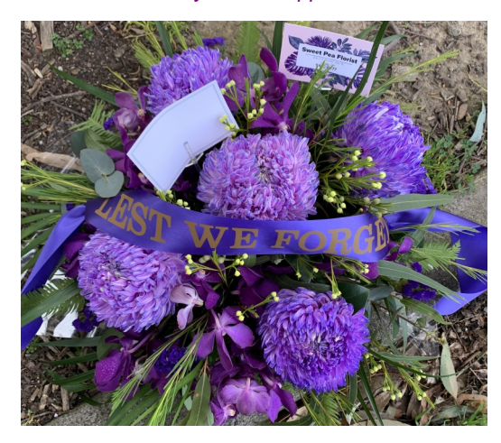
Above: The wreath laid at the Memorial Service.

"The Diamond Valley Vietnam Veterans members thank the members of the Parade College community for their attendance at its Community Memorial Service on Saturday 11th August last. The interest of the school community in the Vietnam Veterans' activity is most appreciated."