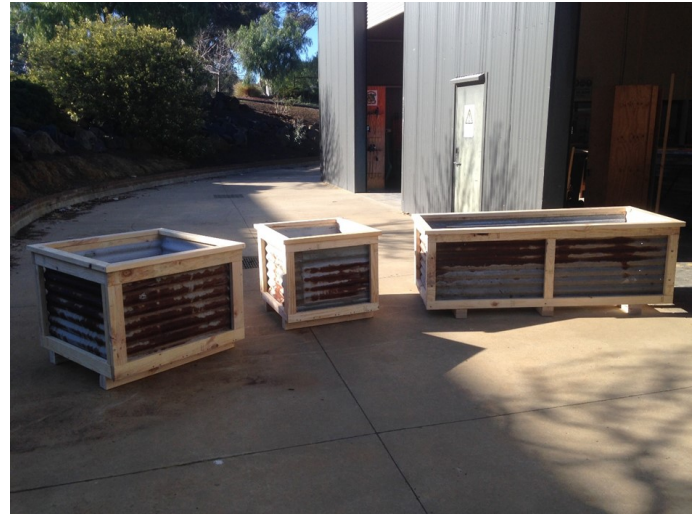
Above: completed planter boxes

This was a very rewarding exercise where the students appreciated their hard work and end result which was for a great cause.