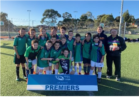
Clockwise from top left: Year 9 Football Division 1, Year 8 Soccer Division 2, Year 7 Football Division 1, Year 7 Soccer Division 2, Year 7 Soccer Division 1, Year 8 Football Division 2

A huge congratulations to all involved and a wonderful result for the Parade College Community. Whilst we acknowledge the efforts specifically of our Premiership teams, we would also like to thank all students who participated across Term 2.