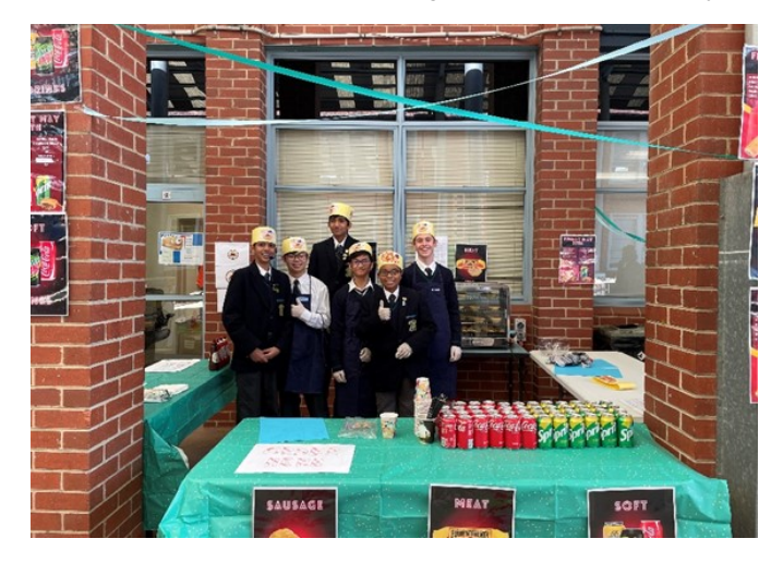
Above: The Altior Crew are ready for business!

This semester, the Year 8 Preston Altior boys took part in Prestons yearly "Market Day" held by the Year 12 VCAL students. Ten boys put their minds and economic wisdom from the Humanities Unit to the test and devised a plan to market, produce and sell a product. Once they made their investment back, the profit was to go to their chosen charity.