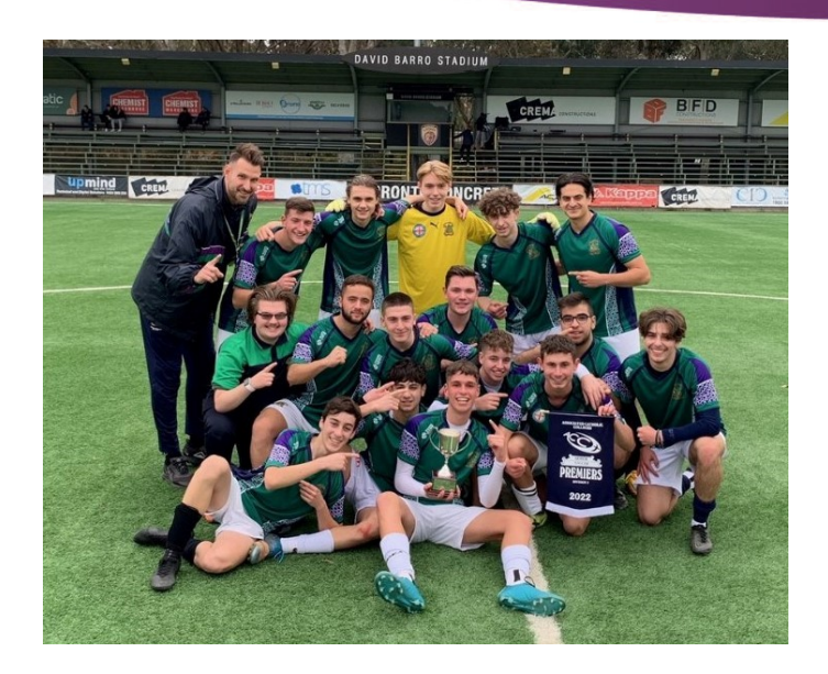
Congratulations to the Senior 2nd XI Football Team on their premiership

The House Leader for Nolan House will be appointed in Term 3, and whilst the position does not commence until 2023, they will work with students and staff joining Nolan House to develop and set the House culture, House colour, House prayer, House logo, House mascot, etc.