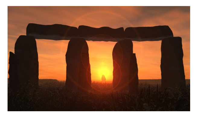
Solstice sunrise at Stonehenge