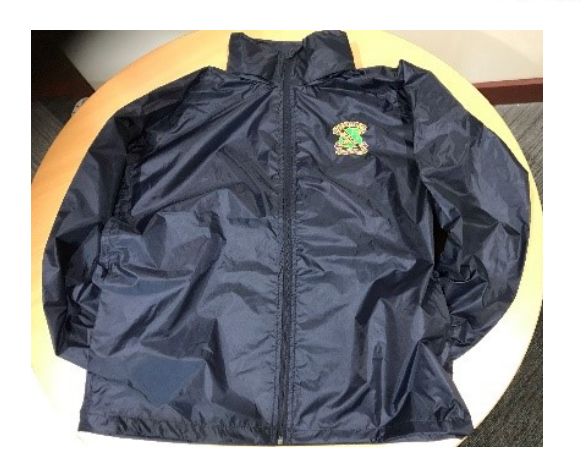
It is not to be considered a substitute jacket to the College Blazer and therefore must not be worn on its own

Embroidered with the Parade logo, this new uniform item is a waterproof lightweight jacket and is permitted to be worn OVER the blazer, protecting the fabric from the wet.