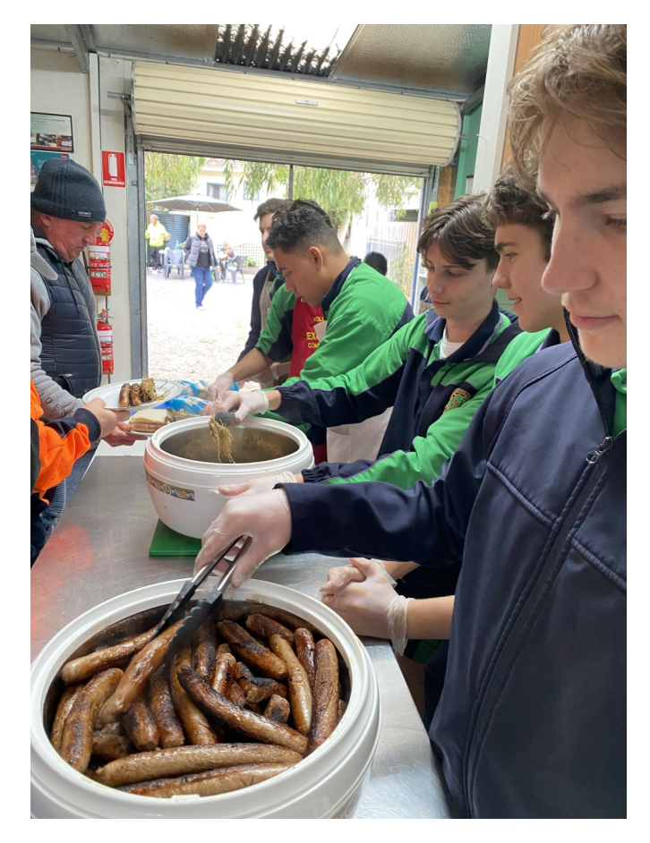
Above: Students helping out at the Exodus Community

The first of the Year 11 Touchstones classes completed their 3-week volunteer placements through May and June. Students are given options to volunteer their time in a schoolbased program such as the Eddy's Back Packs Program, the Waterford Garden, and various Sustainability projects. Others chose to volunteer with community organisations such as The Big Group Hug, Aged Care facilities, and The Exodus Community Centre.