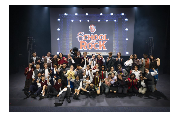
Above: The School of Rock Cast

- Dewey Finn, 'School of Rock - The Musical