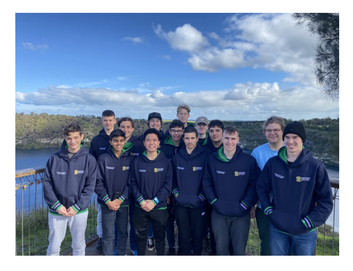
Above: Students taking part in the Generations of Jazz in Mount. Gambier.

The students performed extremely well and placed fourth for the division which is a commendable effort for a national competition.