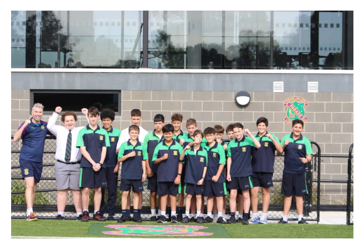
Above: A fantastic effort from B16, raising $2842 for the Nzara Hospital in South Sudan.

It was an amazing experience and one of my favourite parts of B16.