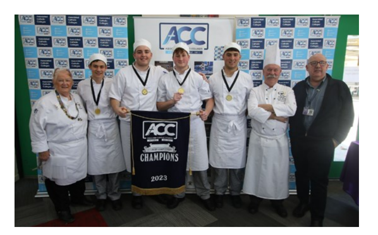
Above: Our ACC Culinary Champions

Parade served Sous Vide Pork Fillet with Autumnal Vegetables and a Deconstructed Apple Crumble.