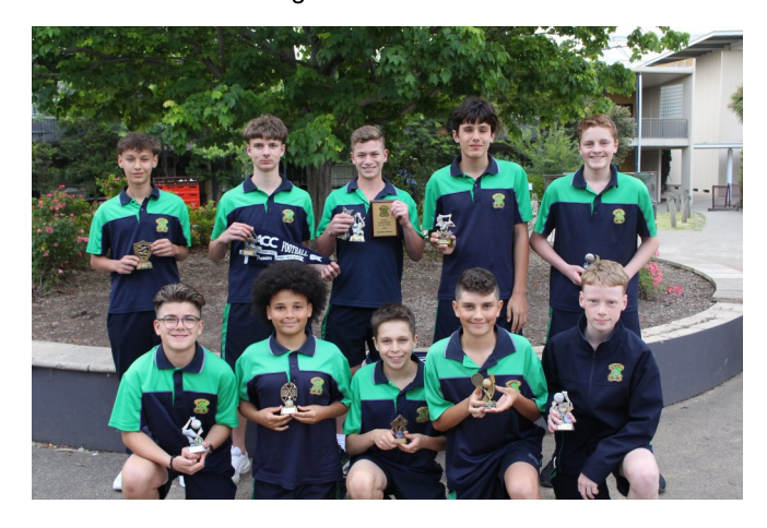
Above: 2023 Year 7 Sport Award winners

In late November, our Year 7 to 10 High Performance and ACC Awards Evening was held. Congratulations to all award winners on the evening.