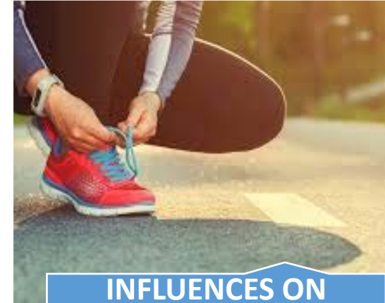
INFLUENCES ON PHYSICAL ACTIVITY LEVELS