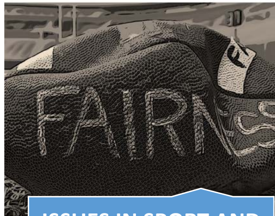
ISSUES IN SPORT AND PHYSICAL ACTIVITY