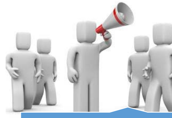
PROMOTING PHYSICAL ACTIVITY